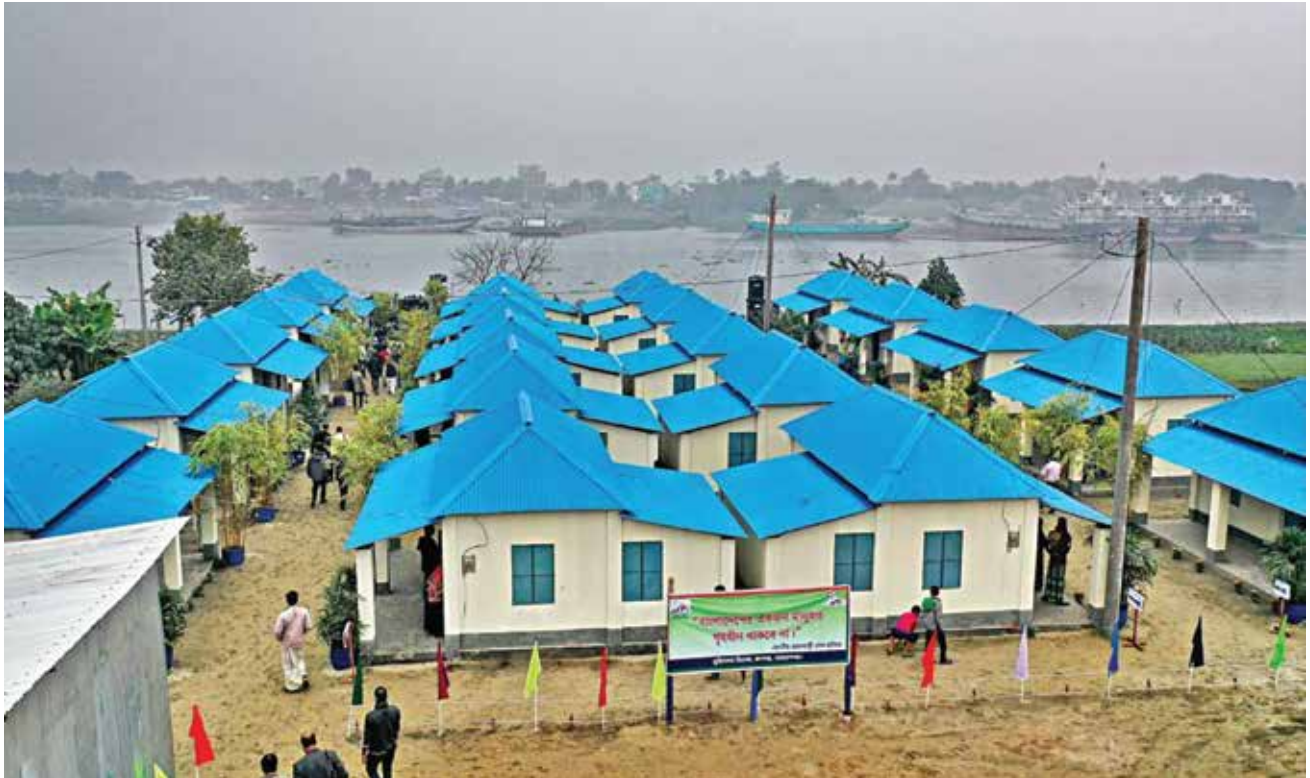
A view of a cluster of houses in Rupganj's Murapara area, built under the Ashrayan-2 project.