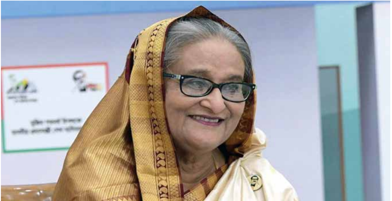
Prime minister Sheikh Hasina.

Prime minister Sheikh Hasina reiterated her pledge that nobody would remain homeless and landless in the country, saying that she considered power as a way to serve the people.