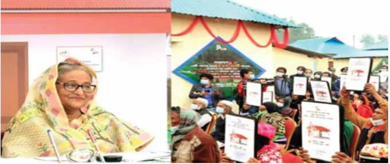
PM Sheikh Hasina

Dream of owning a home of 32,904 more homeless and landless families has come into reality as Prime Minister Sheikh Hasina today handed over houses to them at government expenses, raising the total beneficiaries' number to 150,233 under Ashrayan-2 Project.