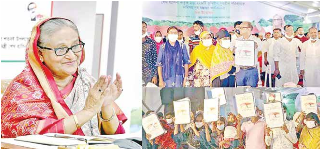
Prime Minister Sheikh Hasina hands over 26,229 homes to landless families virtually under the third phase of the Ashrayan-2 project at a press conference from the Prime Minister's Office in the city on Thursday.