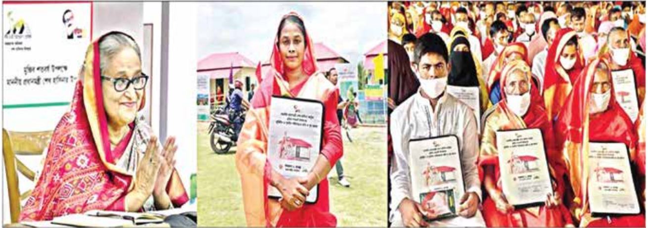
Prime Minister Sheikh Hasina virtually joins a ceremony where houses and land were handed over to 26,229 families from five upazilas on Thursday.