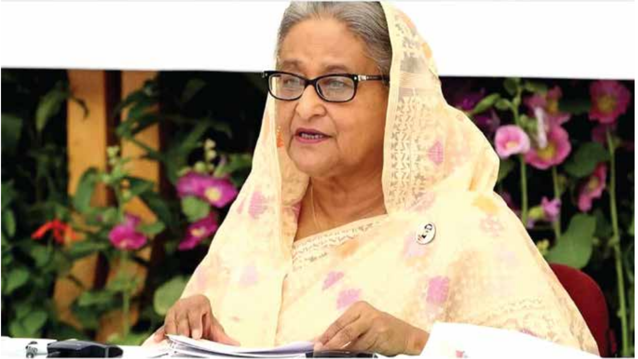
PM Sheikh Hasina | File Photo