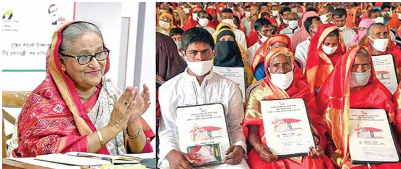
Prime Minister Sheikh Hasina inaugurates the handover of 26,229 houses to homeless and landless families through videoconferencing from her official residence Ganabhaban on Thursday.

Prime Minister Sheikh Hasina on Thursday expressed her firm conviction that the present government will ensure home for everyone irrespective of their political affiliation and views, saying it's her responsibility as premier to provide decent life to countrymen, reports BSS.